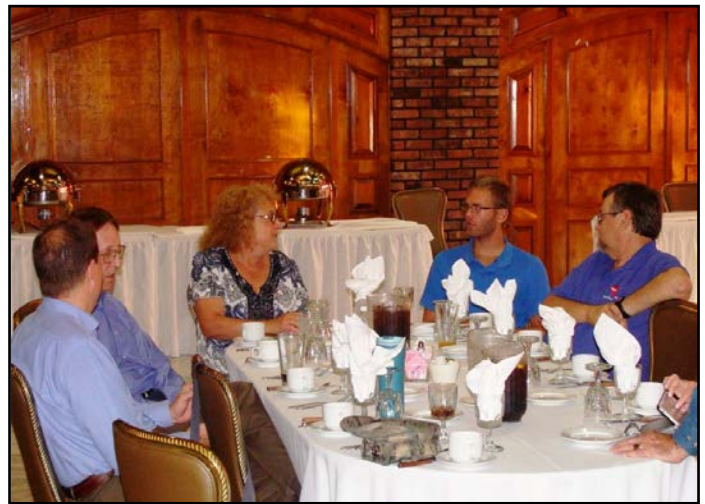
NJAIHA members network and catch up with one another prior to the start of the before-dinner technical presentation.