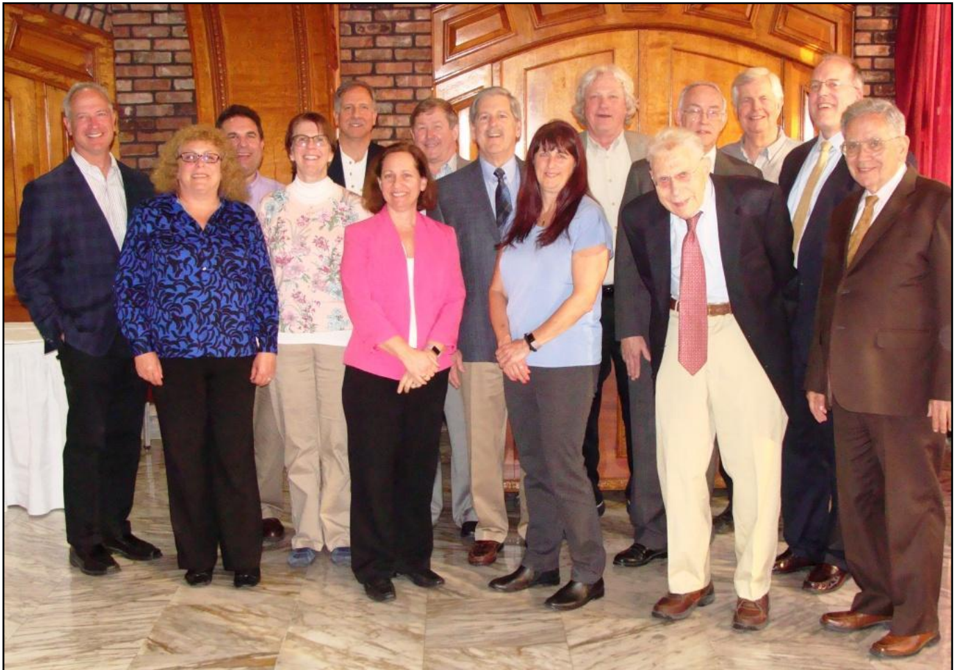
NJAIHA Past Presidents' Night - April 20, 2017 Snuffy's Pantagis Renaissance, Scotch Plains, NJ

The New Jersey Section AIHA held their annual Past Presidents' Night on April 20, 2017, once again at Snuffy's Pantagis Renaissance restaurant in Scotch Plains, NJ. Among the NJAIHA members and guests joining in the festivities that night were sixteen Section Past Presidents whose terms dated as far back as 1976-77. Another great night for the NJAIHA!