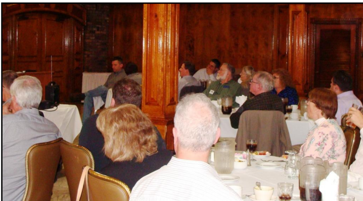
NJAIHA Past-Presidents, members and guests take in one of the evening's technical presentations.