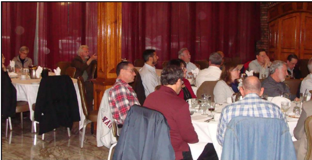
NJAIHA members, guests, and area college students at the well-attended October 2018 NJAIHA dinner meeting.