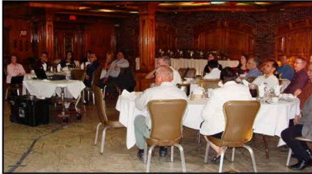
NJAIHA members and guests take in the before-dinner technical presentations.