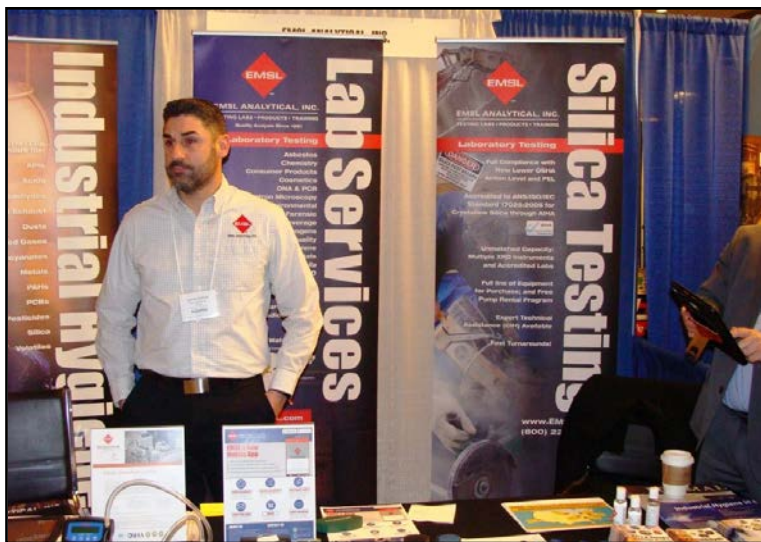
$500 Silver Level EMSL Analytical, Inc.