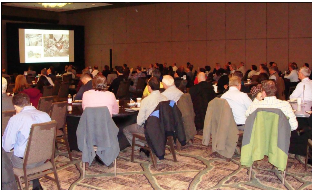
Attendees gather in the Westin Princeton Ballroom for one of the six technical presentations given at this year's Conference.