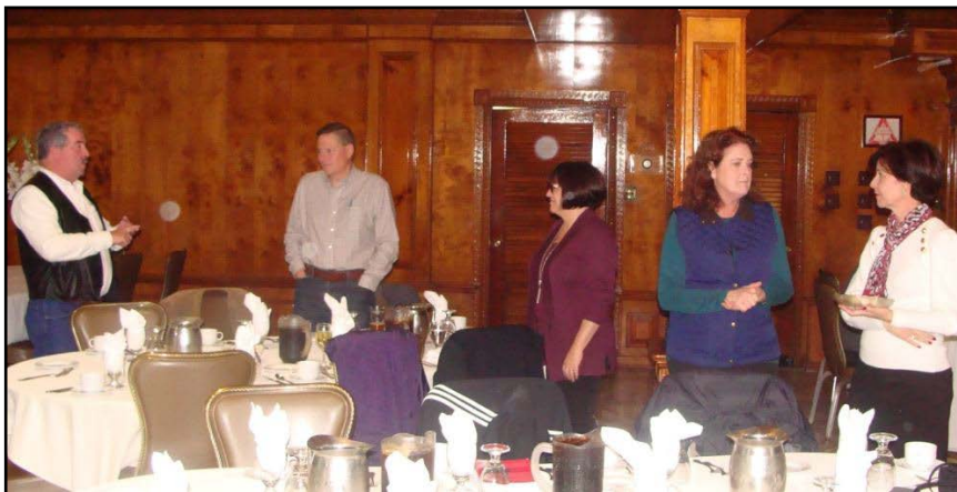
(top and right) NJAIHA members get a chance to catch up with one another during the networking time preceding the before-dinner technical presentation.