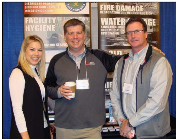
$500 Silver Level Insurance Restoration Specialists, Inc. (IRS)