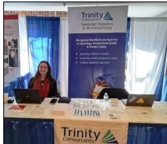
$1000 Gold Level - Trinity Consultants SafeBridge Regulatory & Life Sciences Group