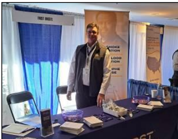
$500 Silver Level - First Onsite