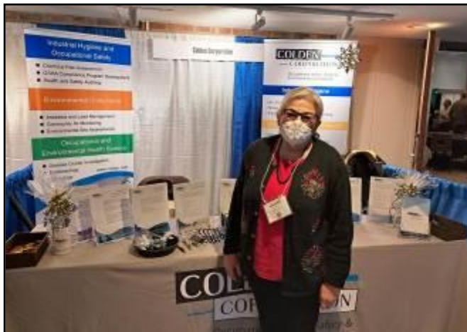
$1000 Gold Level - Colden Corporation