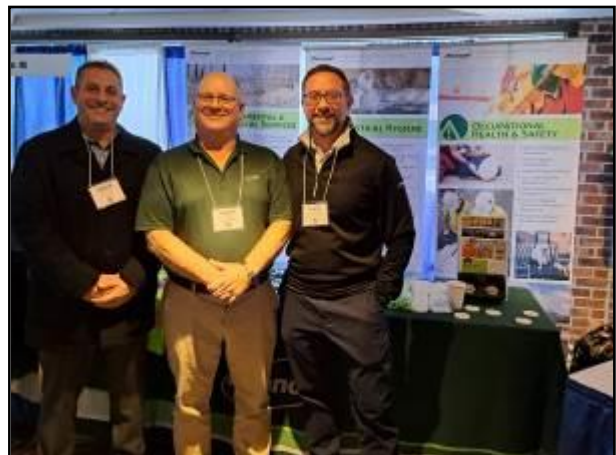
$250 Bronze Level - Pennoni Associates, Inc.

Additional Corporate Sponsor (without booth) - $1,000 Gold Level - Hillman Consulting, LLC