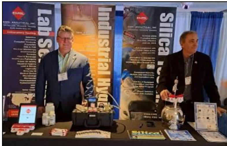
$2,000 Platinum Level - EMSL Analytical, Inc