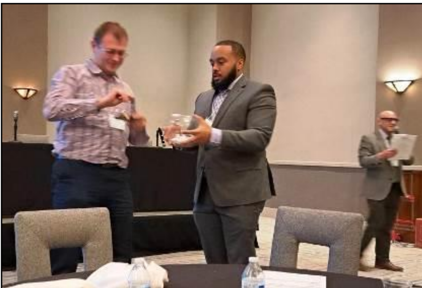
Door Prize winners had a chance to participate in the process and pick the next lucky winner.